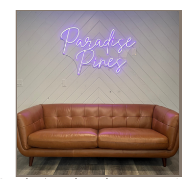
Sunday* to Thursday 11am to 9pm Friday & Saturday 11am to 10pm

*On long weekend Sundays we are open till 10pm. For member events such as Ladies Night or Men's Night we will stay open past 9pm.